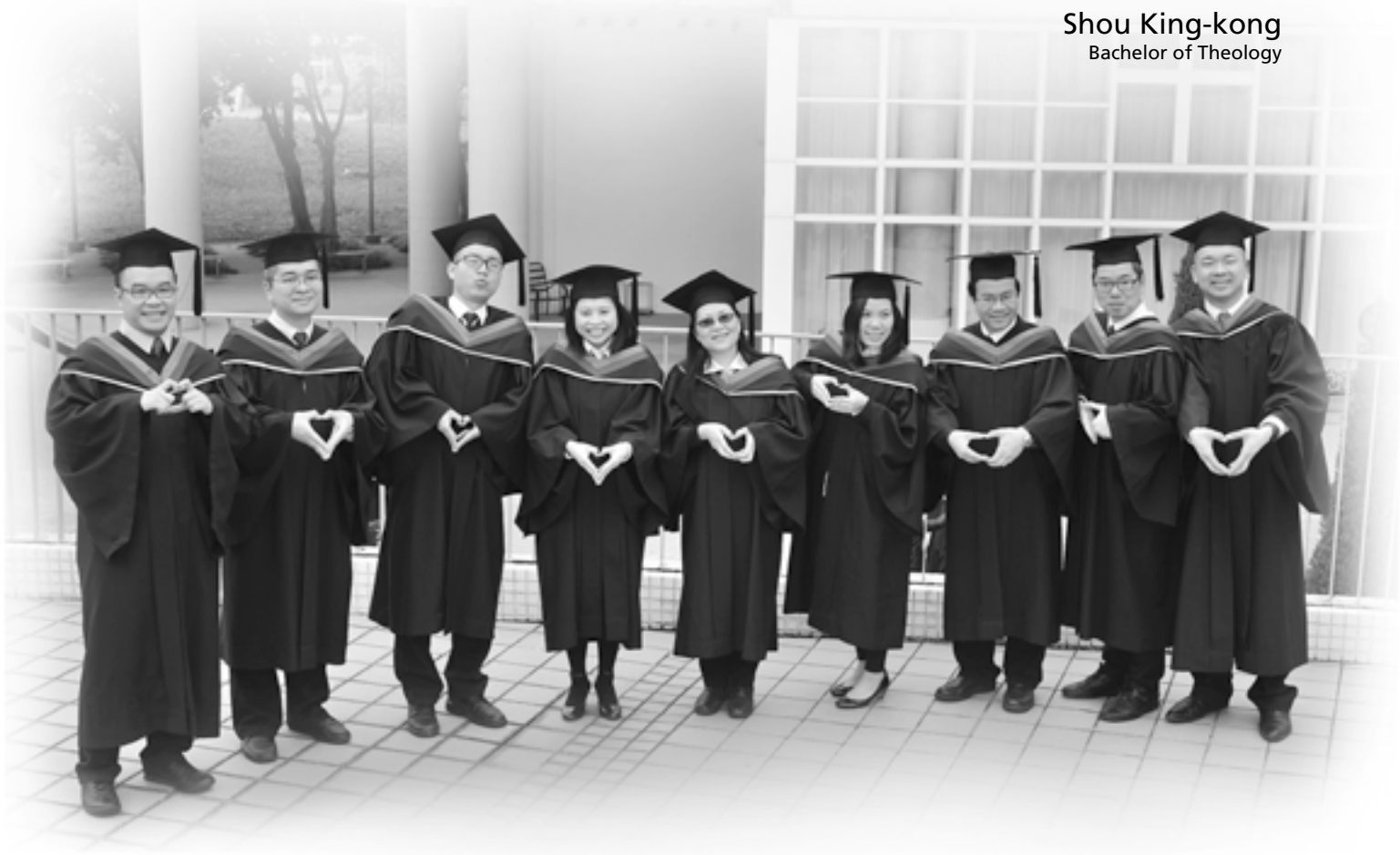
The graduation class of Bachelor of Theology