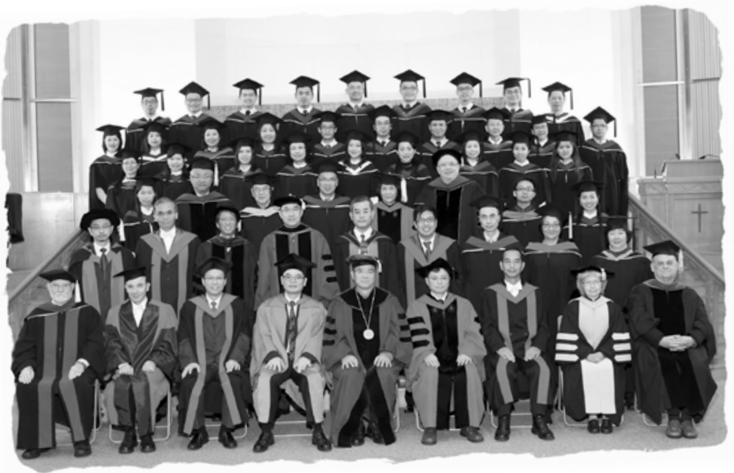
The sixty-fourth class of graduates is pictured along with all the faculty

Tsui Sau-lan Master of Pastoral Counseling