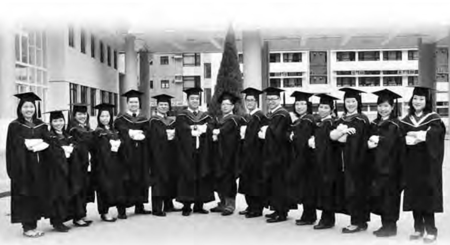
The graduation class of Master of Divinity

It is by God's grace that I can finish this long race; it is through my husband's love that I could manage and enjoy both my familial responsibilities and my studies. This along with the knowledge of theological thinking from teachers and the unconditional encouragement from classmates makes me feel endlessly grateful.