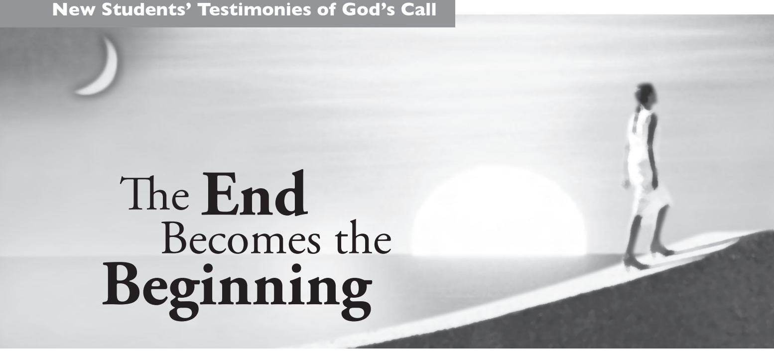
Kam Wai-man (M.Div. 1)

your own understanding. In all your ways acknowledge Him, and He will make your paths straight. Do not be wise in your own eyes; fear the Lord and turn away from evil. It will be healing to your body and refreshment to your bones." (Pr 3:5-8)