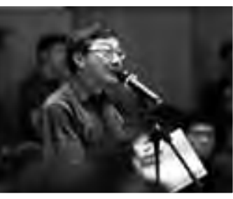
There were three wonderful question-and-answer sessions during the academic symposium and lectures.