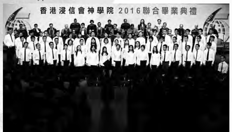
The Seminary Choir sang "Praise Him," wishing all glory be to God on high.

HKBTS's Main Program (the 65th class), Lay Theological Education Department (the 17th class), and Distance Education Program (the 16th class) was held on November 13 at Queen Elizabeth Stadium, Wanchai. In the 2015-16 school year, there were 54 graduates from the degree programs or diploma or certificate graduates from the same LTED's BCS program, together with 189 graduates from the diploma and certificate programs. Thank God for His faithfulness and kindness in leading the seminary throughout these 65 years. Pray that He will also lead each of our graduates in the ministry path.