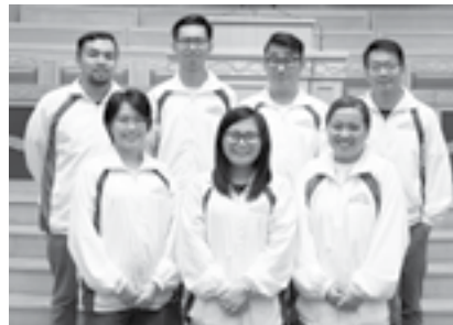
Executive Committee members of the Student Union 2019

The Executive Committee of the Student Union 2019 took office in January. Please pray for them and support their activities this year.