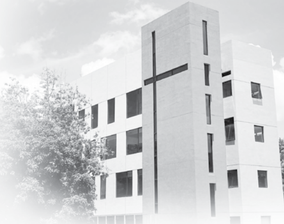
The New Academic Building (August 26, 2021)

The construction work of the new academic building under the "Faith, Hope, and Love Project" is estimated to be completed this October. Internal Decoration will begin soon after the issuance of the Occupation Permit for the building. As of mid-October, HKBTS has been blessed by our Lord through churches and individuals with HK$43 million to pay for the actual construction costs. We request your continuous support by prayers and monetary donations for HKBTS to meet the fundraising target at HK$70 million.