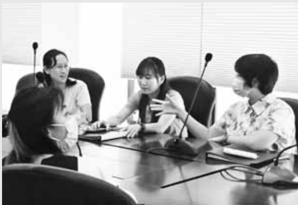
Students discussing in groups