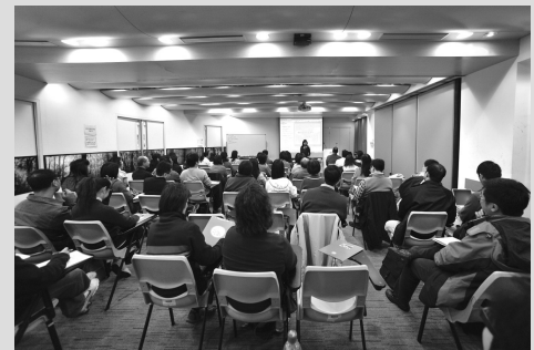
Statistics of Courses/Talks for 2009-10