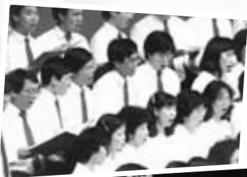
The 35th Anniversary Thanksgiving Music Celebration in 1986