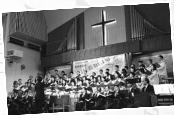
Church Music Revival Meeting in 2009