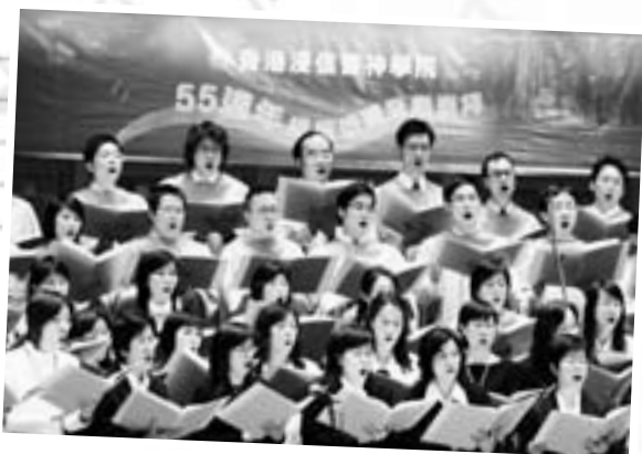
The 55th Anniversary Musical Worship Service of Thanksgiving and Celebration in 2006

In 2009 and after 20 years, HKBTS's Annual Concert left the stage of the Cultural Center and moved back to the stage of the local church under its new name "Church Music Revival Meeting." The recent meeting was held on April 23 at Kowloon City Baptist Church with the theme "Be Strong and of Courage, Dare to March on the Road Ahead." This marks a clear direction: we hope to send a clear message to our audience that the annual concert is more a service than a music appreciation concert. Not only do we long to offer praise to the Lord, but we also want to present a challenging message, inviting brothers and sisters to join us in serving God full time.