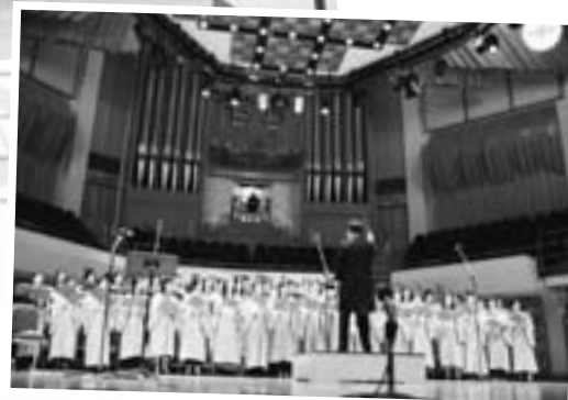
The 50th Anniversary Concert of Praise and Testimonies in 2001

carried out their singing ministry in church music services and evangelistic meetings in local churches. Church music meetings were sometimes conducted off campus. The choir was invited to sing at the Hong Kong Baptist Convention and the Billy Graham Crusade Rally. They could be found singing Christmas carols in a shopping mall or conducting an evangelistic meeting outside Hong Kong.