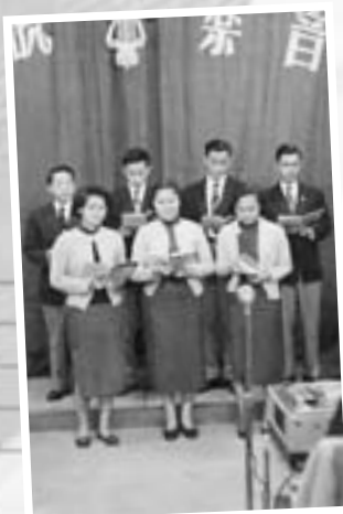
The 1956 Music Service Evening