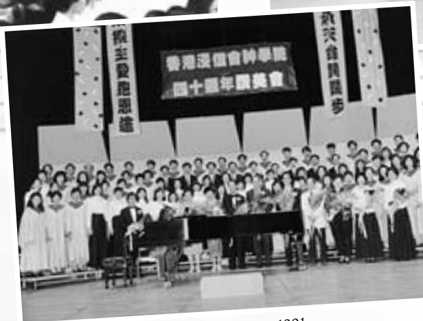
The 40th Anniversary Concert of Praise in 1991