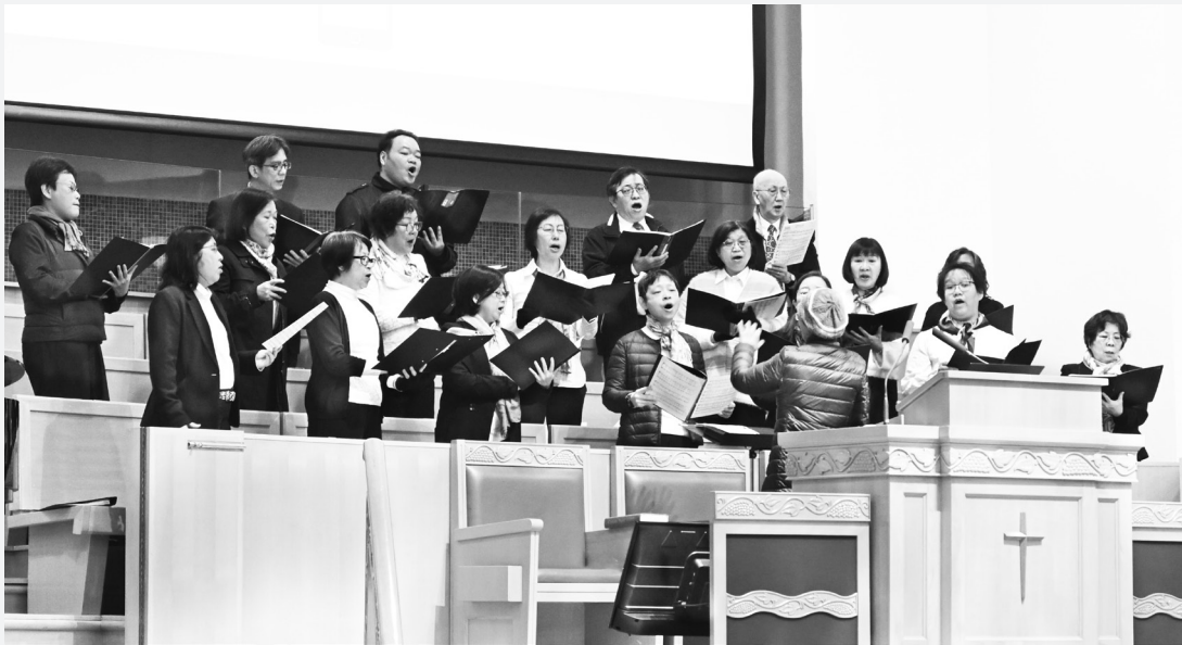
The Alumni Choir was singing hymns.