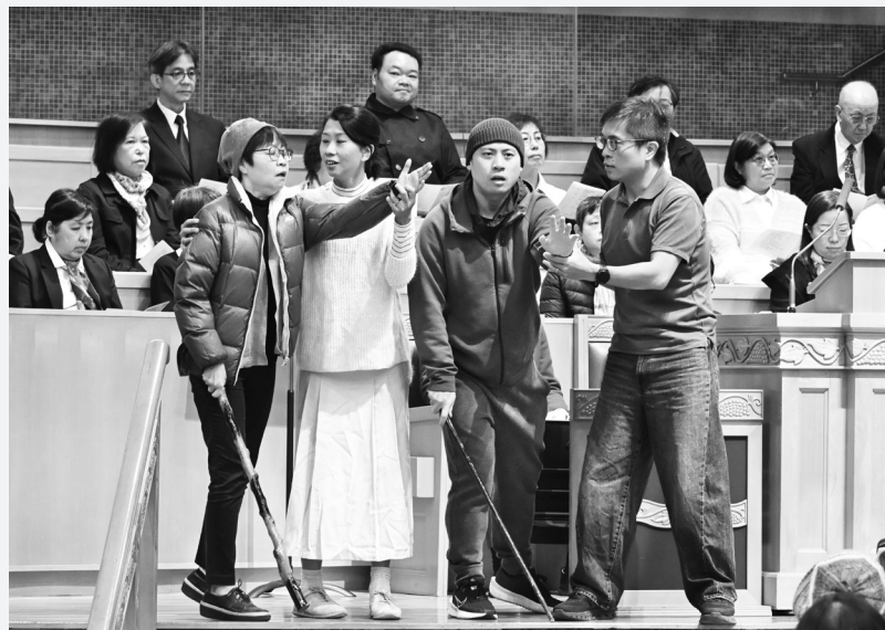
The reading of Scripture interspersed with pantomime added to the power of the Scriptures.